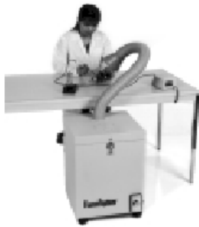
Shown with one optional arm