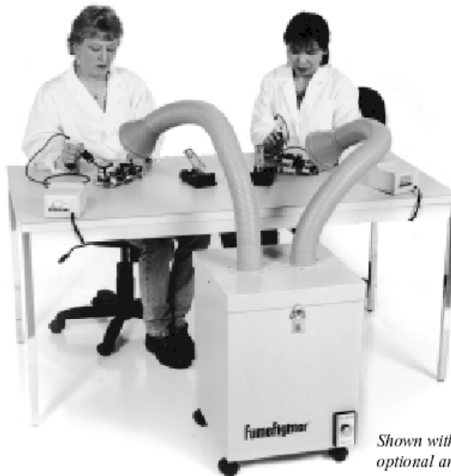
Shown with two optional arms