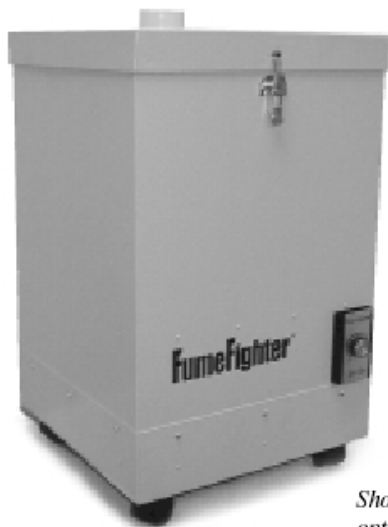
Shown with optional silencer