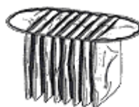
Up to 28 sq. ft. Filter Media

The NEW XtractMAX ® electric series of portable intermittent duty vacuums are small in size but huge in performance! The oversized, high-efficiency filters and lightweight easy maneuverability make XtractMAX ® the ideal solution for even the finest dry material cleanup — powder coating, carbon black, talc, concrete dust, lead and asbestos.